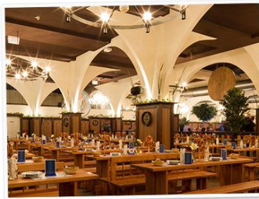
Hofbräuhaus am Platzl